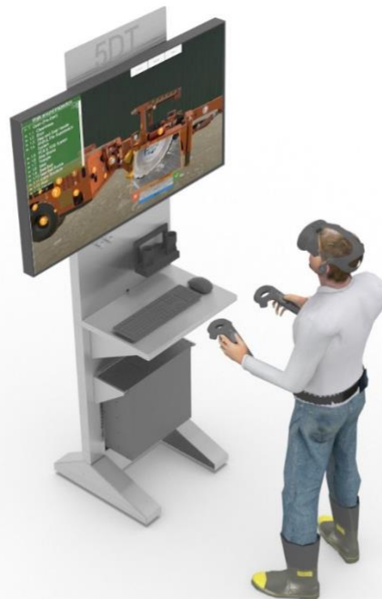
Figure 1 – SimBASE VR Station The user views the virtual world with a virtual reality (VR) head mounted display (HMD). The user navigates in the virtual world and interact with the virtual world with two VR space controllers (wands).

The system will make use of the existing SimBASE VR stations at SENMC, as shown in the following image.